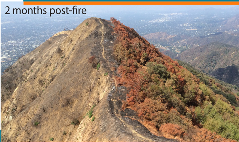
Fig 1: Vegetation recovery following the 2016 Fish Fire near Los Angeles, CA. The photo on the left was taken two months after the fire. The right photo shows vegetation recovery 45 months after the fire. For comparison, an unburnt landscape (partially covered in red fire retardant) is seen on the right side of the prominent ridge.