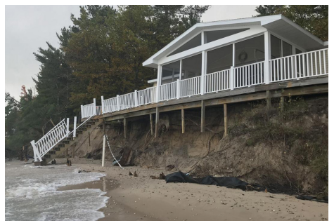
Beaver Island, MI