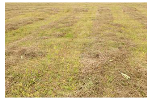
Very dry pasture conditions were observed in far northern Wisconsin in late August

Agriculture: Extremely wet conditions in July and August were problematic for crops in southern Ontario, where farmers reported reduced yields, crop rot, and problems accessing wet fields. Field crops in western New York started the season with delayed planting due to drought and ended with delayed harvest due to excess wetness. The official Michigan <u>apple</u> <u>crop</u> estimate was above average, citing favorable weather for most growers in 2023, with some regionalized losses due to frost and hail.