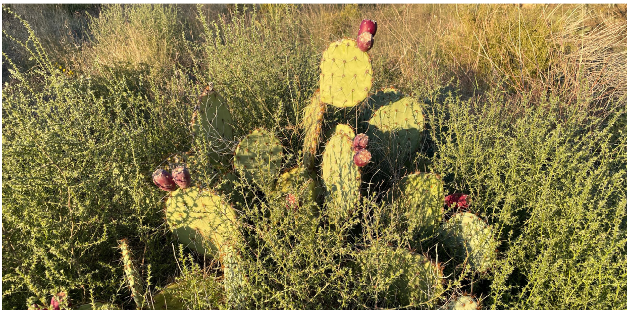
(Top left) Albuquerque, New Mexico, Sept. 27, 2023. A distant thunderstorm. (Top right) Lake Granby, Colorado, June 16, 2023. Pinyon Pine after a rainstorm. (Bottom) Albuquerque, New Mexico, Sept 27, 2023. Prickly Pear.